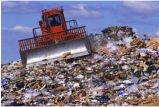
Solid Waste Disposal Sites (SWDS)